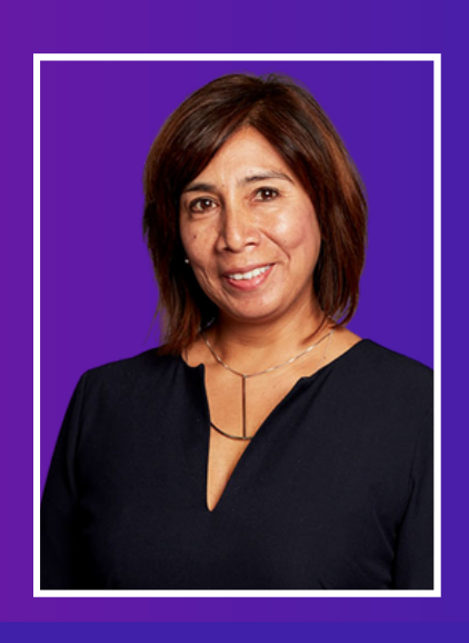
COMMISSIONER, NEW YORK CITY DEPARTMENT OF CONSUMER AFFAIRS