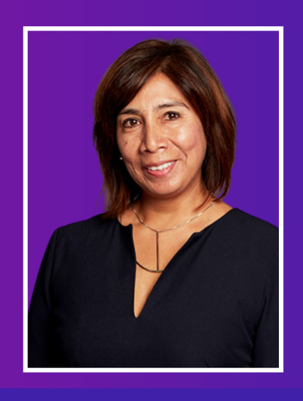
LORELEI SALAS COMMISSIONER, NEW YORK CITY DEPARTMENT OF CONSUMER AFFAIRS